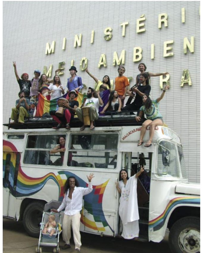
Members of La Caravana celebrate in Brazil