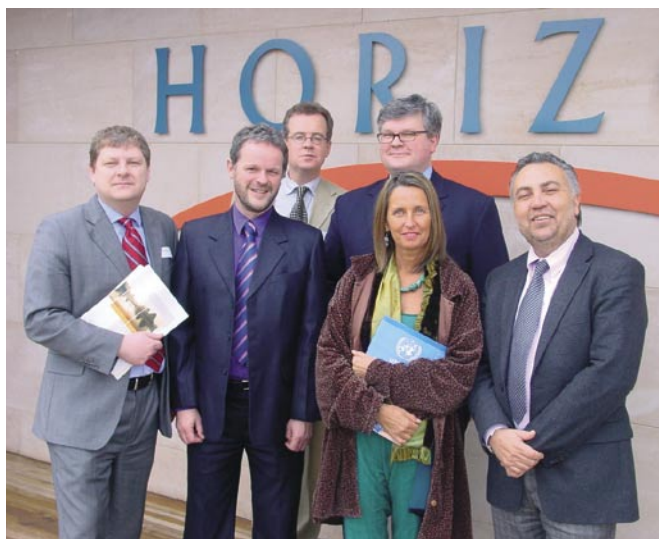
Findhorn members at the CIFAL centre, Forres, March 2006

Tamera launches its Mote Cerro 3-years peace research project in May 2006. Young peace workers from around the world will study the theory and practice of peace, focusing on community-building and truthful communication in all areas of life, including political networking, ecological thinking, gardening, building, and conflict resolution. The students will build the 'Solar Village': a model village, that generates its energy from solar power. For details contact: amelie.weimar.igf@tamera.org