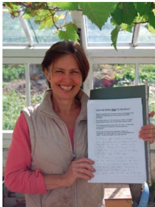
A successful grant applicant.

There was a 5-day 'European Ecovillage Network – Training and Research for Sustainability' course following the general assembly and thirty participants received grants to fund their travel and participation.