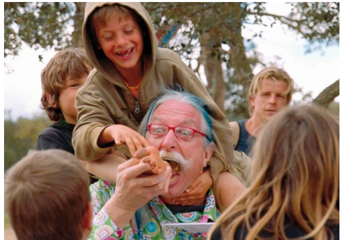
Patch Adams plays with children at Tamera ecovillage, Portugal

Patch Adams, the clown doctor from the US, took part in the Easter conference, 'Creating Models for a Future without War', at Tamera ecovillage in Portugal.