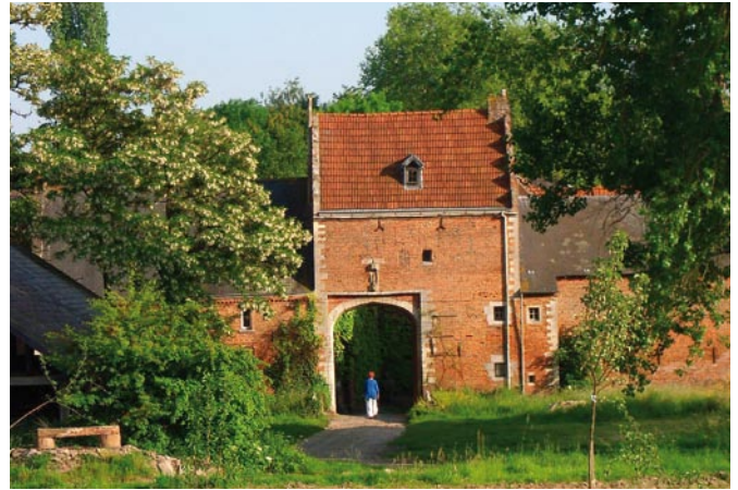
The gates to the Kasteel Nieuwenhoven, Belgium are open to visitors.

This summer a new ecovillage at Kasteel Nieuwenhoven, Belgium, opens its gates to welcome visitors to a wide range of activities.