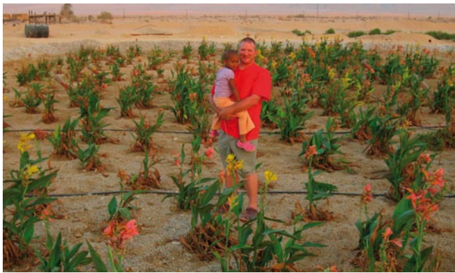
An evocative photo of the ground breaking wetlands at Kibbutz Lotan.

Information about the system is at: www.kibbutzlotan.com