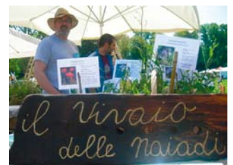
Damanhur's edible plant display.

This initiative was formally launched at one of Italy's most important gardening fairs at