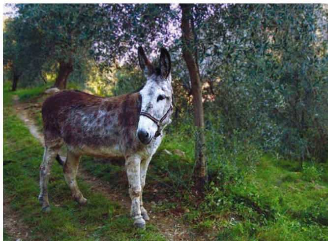
Benjamin the Donkey will ease the transition of the Torri Superiore community to a less oil dependent future.

The Italian community, Torri Superiore, aims to launch its own Transition initiative in 2008.