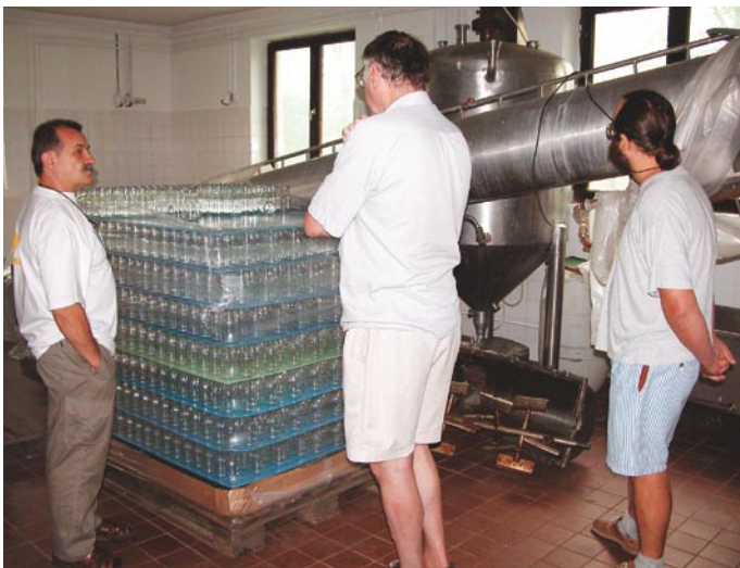
Opposite: Model of the ecovillage.

The idea of the farm was to earn money from the produce to build an ecovillage, but it has been difficult. In the farm building we see two big heaps of grain: one wheat and the other spelt. “This year, the three month drought has reduced the harvest to a disastrous 30% of normal yield. This room used to be filled up with grain. The spelt has lower yield, but a much higher protein content. Half of it disappears when the shells are taken off in this machine.”