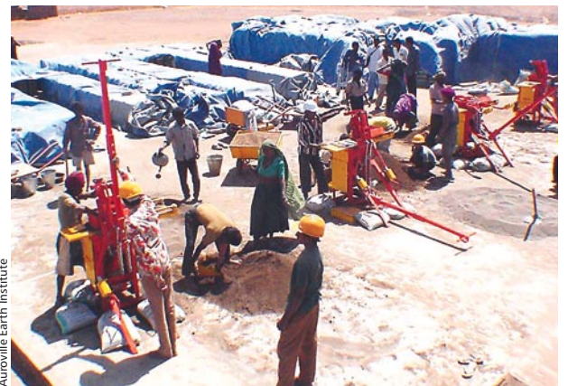
Auroville Earth Institute

Along with earth construction, Auroville has had great success in the use of ferrocement, where a thin cement mortar is laid over steel wire meshing that acts as reinforcement. While not a truly sustainable solution, it has proven to be a very cost-effective and highly efficient building material that is adaptable,