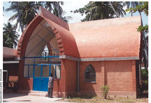
Auroville Earth Institute