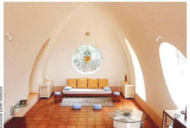
Auroville Earth Institute