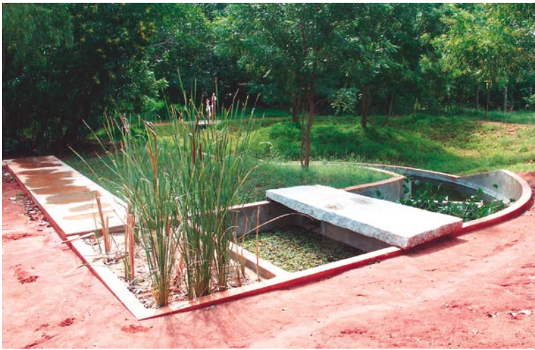
Above: Small scale greywater filter beds.